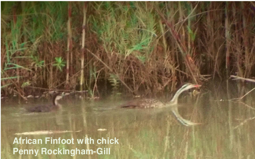
African Finfoot with chick Penny Rockingham-Gill

Swallow-tailed Bee-eaters and Barred Long-tailed Cuckoo were seen along the Umfurudzi River on a bird walk. Umfurudzi River has shallow waters which is why Giant Kingfishers, Pied and Half-collared Kingfishers, storks and Green-backed Heron visit the shallow pools. Three-banded Plovers are also very common in this river. Surprisingly, on my last visit there on 25 February, the river was completely dry and most water birds moved down to the Mazowe River; that explains why we are now have over 100 Reed Cormorants roosting on the reed island in front of the chalets.