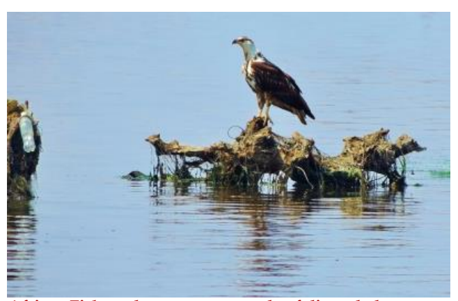
African Fish-eagle amongst a tangle of discarded nets

At the main camp, there were plenty of Scarlet-chested Sunbirds, the odd White-bellied Sunbird and a few Purple-banded Sunbirds as well. A Cardinal Woodpecker tapped away in the trees and an Orange-breasted Bush-shrike called persistently, competing with the irritating radio disturbing the peace (radios used to be banned in rest camps, for good reason!).