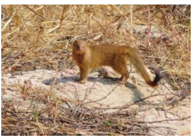
Slender mongoose at Preparation Creek and Kirk's Rock Agama (below) at the jetty

Eleven birders proceeded to the park entrance where c .35 species were seen, including Red-backed Mannikins. After paying our dues, we drove along good sandy roads to see what birds were around. The vlei south of Pax Park was burnt and that yielded Capped Wheatears, Mocking Cliff-chat, Retz's Helmet-shrike and a pair of Buffy Pipits, amongst others.