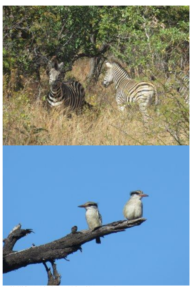
Wildlife & birds at Chinyika Ranch

Buntings appeared, Jameson Firefinch and their friends, Blue Waxbills, African Yellow White-eyes, many pairs of Green-winged Pytilia and even Orange-winged Pytilias. A mother Natal Spurfowl with her two big chicks following, stealthily crept to the edge of the pond. So lovely to study their feathered markings close-up. The Arrow-marked Babblers in numbers looked relaxed, chatty but bossy. A pair of Yellow-bellied Greenbuls, so bright in the sunshine, with gruff songs and the White-browed Scrub-robin entertaining us with his vocal repertoire.