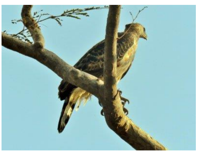
A juvenile African Crowned Eagle at Lasting Impressions

At Mandalay Dam, Eiffel Flats: 3 Comb Duck, 3 African Pygmy-goose, 34 White-backed Duck, 79 White-faced Duck, 2 Common Moorhen, a Malachite Kingfisher, 5 African Purple Swamphen, a Little Grebe and 1 Lilac-breasted Roller.