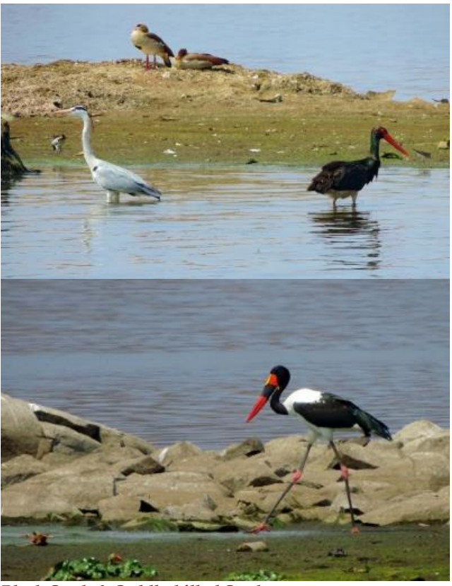
Black Stork & Saddle-billed Stork

Next stopping point was Preparation Creek but as the lake was exceptionally low, we had a few kilometres of shoreline to wander along. Grey-headed Gulls, two flocks of Red-billed Teal totalling around 150, the odd wader, plus a pair of Common Ostrich were visual. A solitary Marabou Stork passed overhead. A couple of us collected discarded gill nets on our return to our parked vehicles and then deposited these bundles at the Parks main camp – on our way there a white rhinoceros was seen alongside the road.