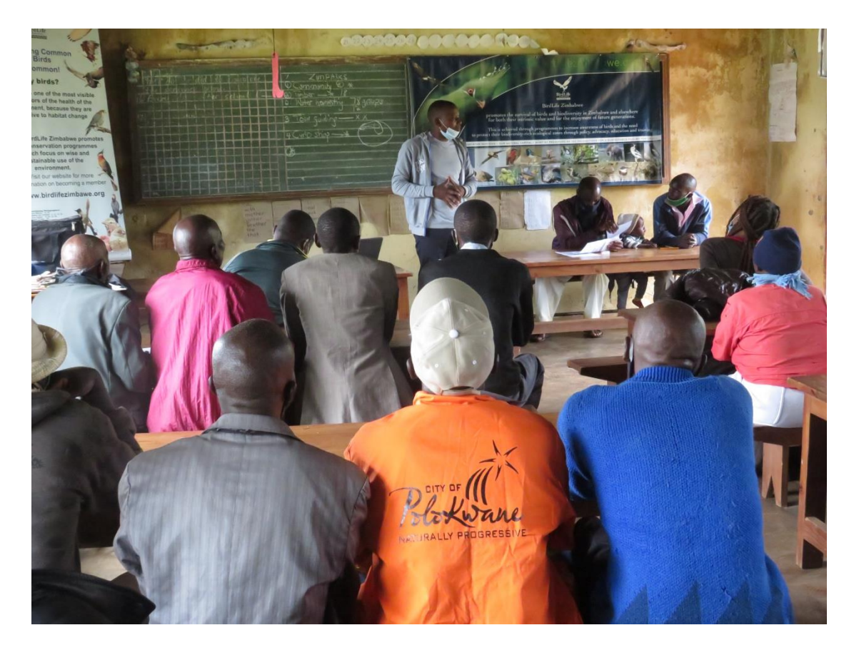
Participants following proceedings at the Blue Swallows and Bird Awareness Workshop at Magadzire Primary School, Nyanga

On 23 March 2021, BLZ organised a community training workshop on Blue Swallows and bird conservation. The workshop was attended by community members of the Magadzire area, comprising of women, young girls and boys. The meeting was also attended by three teachers from the Magadzire Primary School. The participants showed huge interest in birding and biodiversity conservation initiatives.