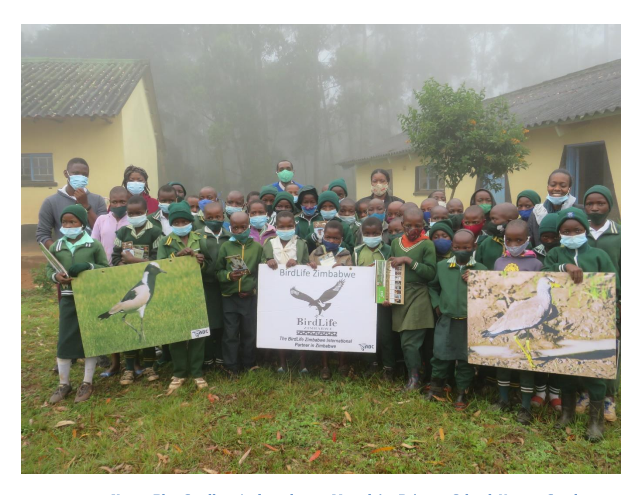
Young Blue Swallow Ambasadors at Magadzire Primary School, Nyanga South

Through the project support, two schools were engaged for the purpose of instilling the interest of birds to the young minds. BirdLife Zimbabwe engaged children from Magadzire and Nyamhuka Primary schools in Nyanga on the 11th and 13th of October 2021. Discussions were centered on the importance of ecosystems, bird identification and migratory birds. The communication theme was "Protect Blue Swallows Nests" was introduced to the school children and with other bird materials shared with students.